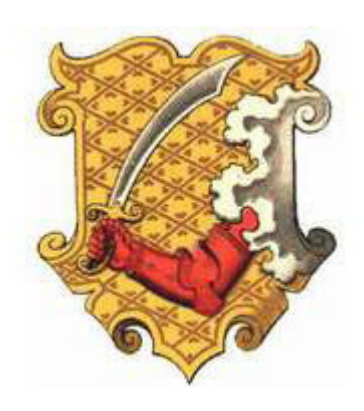
The coat of arms of Bosnia and Herzegovina as a land of Austria-Hungary from 1878. to 1918.

only difference between them is discrete confessions.<sup>35</sup> If one will apply German Romanticist criteria upon ethnonational identity of/among the Yugoslavs surely at least all Shtokavians (all Serbs, all Montenegrins, all Boshnjaks and majority of Croats) would be considered as a single ethnolinguistic nation with the right to live in their one national state organisation which we can name as Shtokavia .