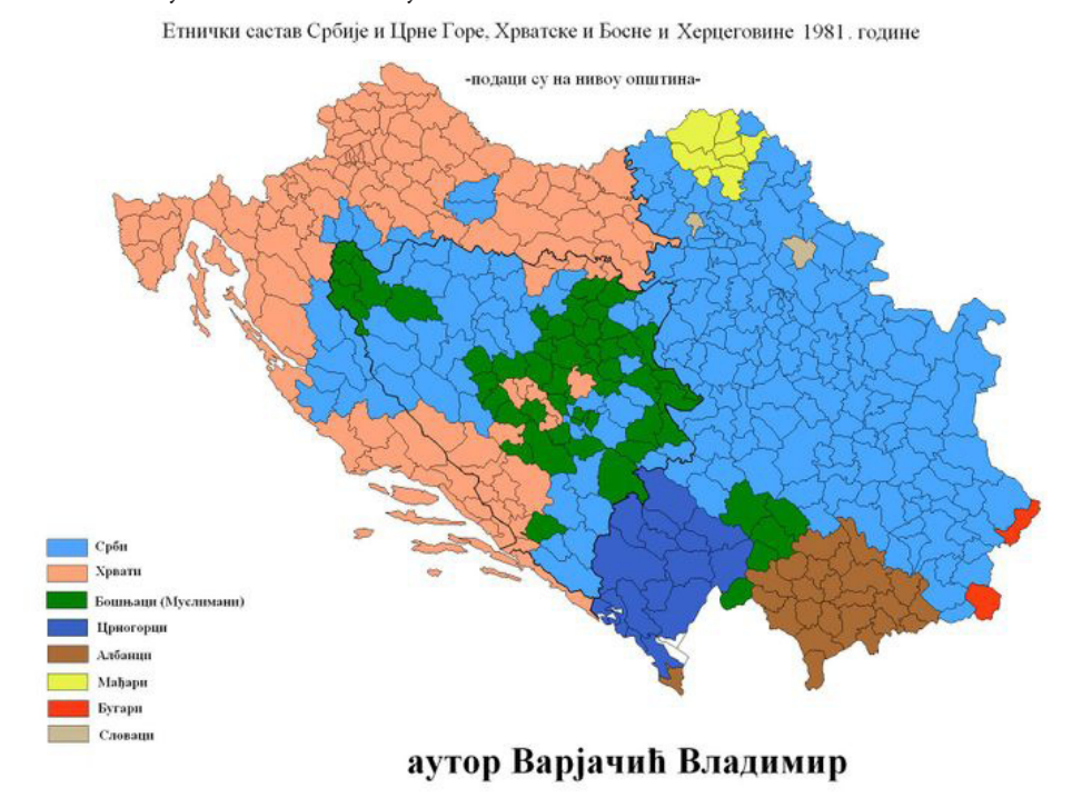
Ethnic composition of Croatia, Bosnia-Herzegovina, Serbia and Montenegro (the territory of former Serbo-Croat language) by census in 1981

is Croatian national Cyrillic script.<sup>17</sup> By "arabica", undoubtedly, it was written one of the most beautiful profane lyric, religious and fine literature – "književnost adžamijska".<sup>18</sup>