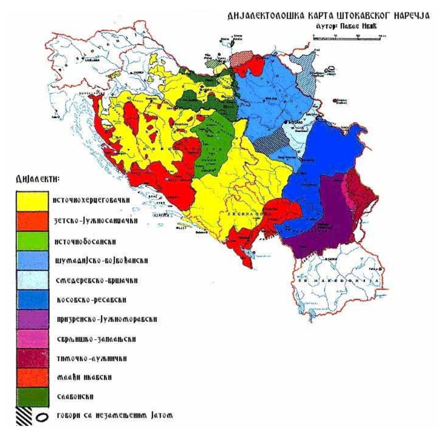
Map of the Shtokavian dialect spoken by 75% of the people from ex-Yugoslavia

The common link that is connecting in practice and even in literature Bosnian with neighbouring Croatian, Serbian, Macedonian and Montenegrin languages are c. 3000 Oriental words ("turcizmi"). For many of them there is no domestic Slavic alternative.<sup>20</sup>